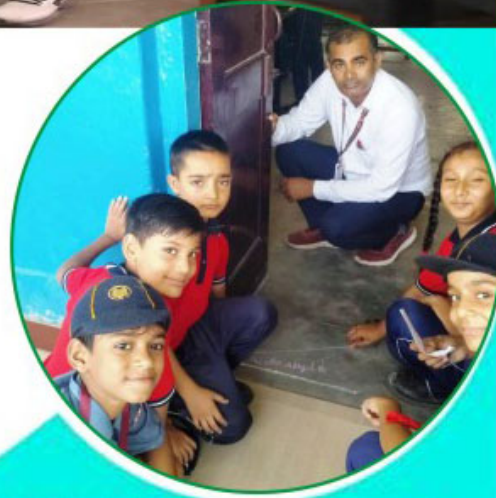
Hybrid Mode of Learning

It is well said, “without teachers life would have no class.” In the age of school closures, hybrid and remote learning caused by the COVID-19 pandemic, this quote surely seems appropriate. When KV Alwar No.1 welcomed its primary class students for physical school after almost two years of online learning. There was much excitement among students, teachers and parents. They demonstrated unanimous willingness to be a part of the learning process which they have not yet experienced in online learning.